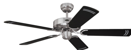
Reversible Black with Silver Stripes Finish Blades