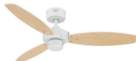
Reversible Light Maple Finish Blades